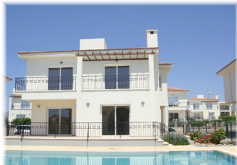
HARMONI VILLAS, HILLTOP VILLAGE, SAFAKOY, BOGAZ